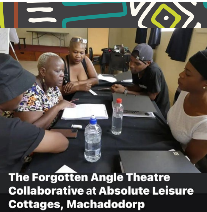
The Forgotten Angle Theatre Collaborative at Absolute Leisure Cottages, Machadodorp